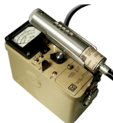
Model 3-97 Gamma Survey Meter