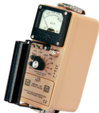
Model 14C General Purpose Survey Meter