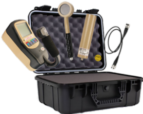
Model 3001-2RK Emergency Response & NORM Kit