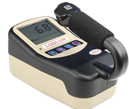
Model 3019 Digital Background Survey Meter - Ludlum