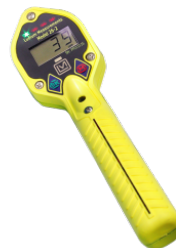
Model 26-2 - Integrated Frisker with Timed Frisk