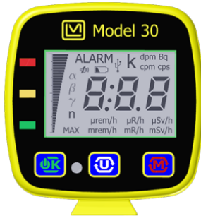
Model 30 Digital Survey Meter - Ludlum