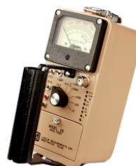
Model 16 General Purpose Survey Meter