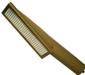
Model 43-5 Alpha Scintillator - Ludlum