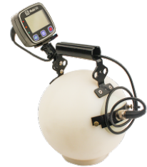
Model 30-7 Series Lightweight Digital Neutron Survey Meter