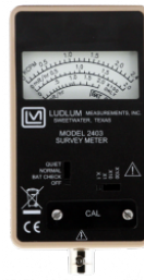
Model 2403 Pocket-Size Survey Meter