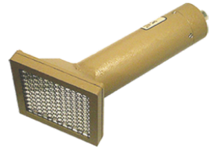
Model 43-65 Alpha Scintillator - Ludlum