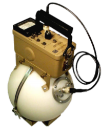
Model 12-4 Neutron Dose Survey Meter