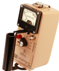
Model 3A General Purpose Survey Meter with Alarm