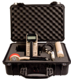
Model 2241-3RK2 Emergency Response Kit