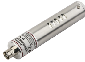
Model 44-38 Energy Compensated GM Detector - Ludlum