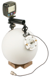
Model 30-4 Digital Neutron Survey Meter