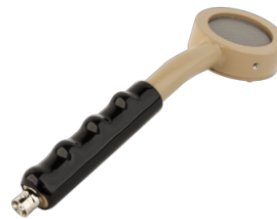
Model 44-9 Pancake GM Detector - Ludlum