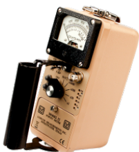
Model 12 General Purpose Survey Meter