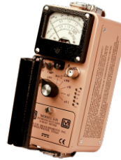
Model 3-IS Intrinsicly Safe Survey Meter