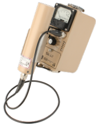
Model 3-98 125I & Alpha-Beta-Gamma Survey Meter