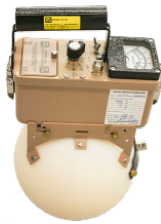
Model 12-4-7 Neutron Dose Survey Meter