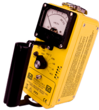
Model 3-IS-1 Intrinsicly Safe Gamma Ratemeter