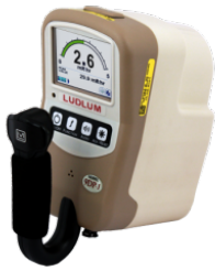
Model 9DP-1* Ambient Dose Ion Chamber