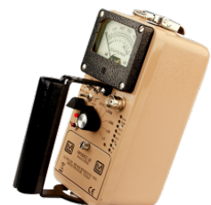
Model 18 General Purpose Survey Meter