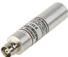
Model 133-6 GM Detector - Ludlum