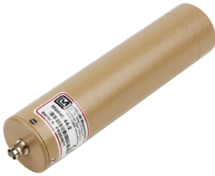
Model 44-2 NAL Gamma Scintillator - Ludlum