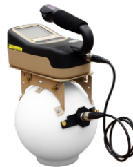
Model 3007 Series Neutron Dose Survey Meter With Optional Internal Gamma Detector