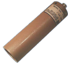
Model 44-1 Beta Scintillator - Ludlum