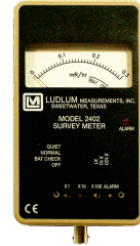
Model 2402 Pocket-Size Survey Meter with Alarm