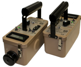
Model 194 Dose Equivalent Rate Meter