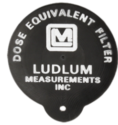
Model 44-9 Ambient Dose Equivalent Filter - Ludlum