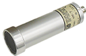
Model 44-7 Alpha Beta Gamma Detector - Ludlum