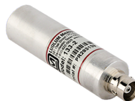
Model 133-2 GM Detector - Ludlum