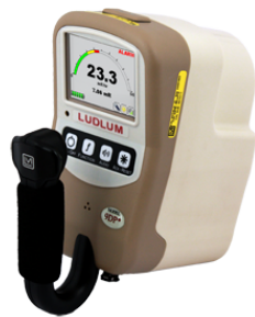
Model 9DP Ambient Dose Ion Chamber Survey Meter - Ludlum