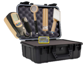
Model 3001-MERK response kit