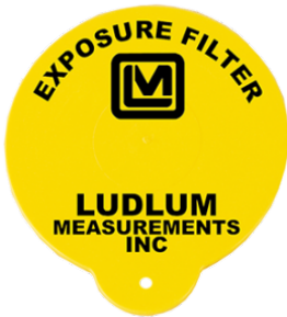
Model 44-9 Exposure Filter Kit - Ludlum