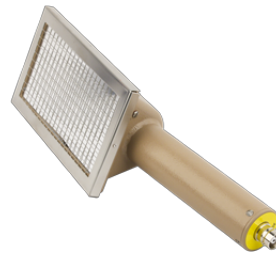
Model 43-92 Alpha Scintillator - Ludlum