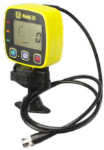
Model 35 Vehicle-Mounted Digital Survey Meter