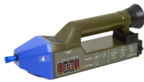
AP4C-SIM Chemical Detector Simulator