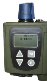
LCD3.3-SIM Chemical Hazard Detection Simulator