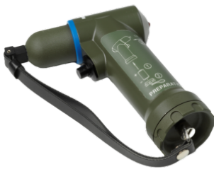
SP4E Chemical Hazard Detection Simulator