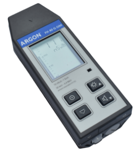
FH 40 GSIM Survey Meter Simulator