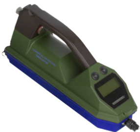
Raid-100M Training Simulator