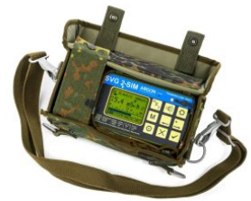
SVG-2 Radiation Hazard Detection Simulator