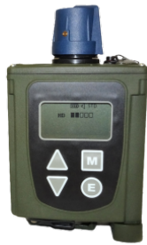
RDS Beta Photon Probe Simulator