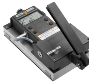
Ludlum 133-6 and 44-2 Radiation Simulation Probes